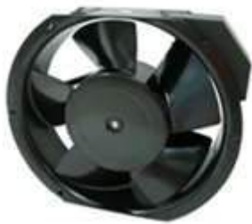
172x150x51 AC Steel Вентилятор