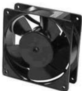
120x120x38 AC Steel Вентилятор