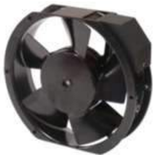
172x150x38 AC Steel Вентилятор