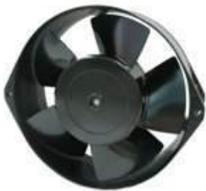
172X150X55 AC Steel Ventilator