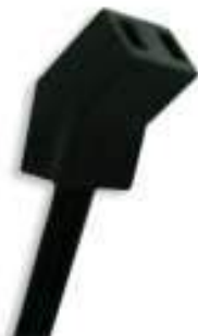
SPT2 plug cords

даташит datasheet вентилятор proВентилятор