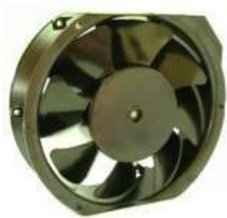
172x150x51 8 blade AC steel Вентилятор