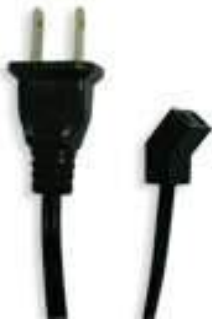
SPT1 plug cords