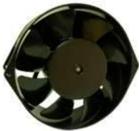
172x150x55 8 blade AC steel Ventilator