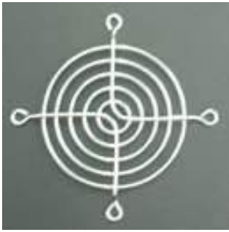
8 CM mental Вентилятор guard